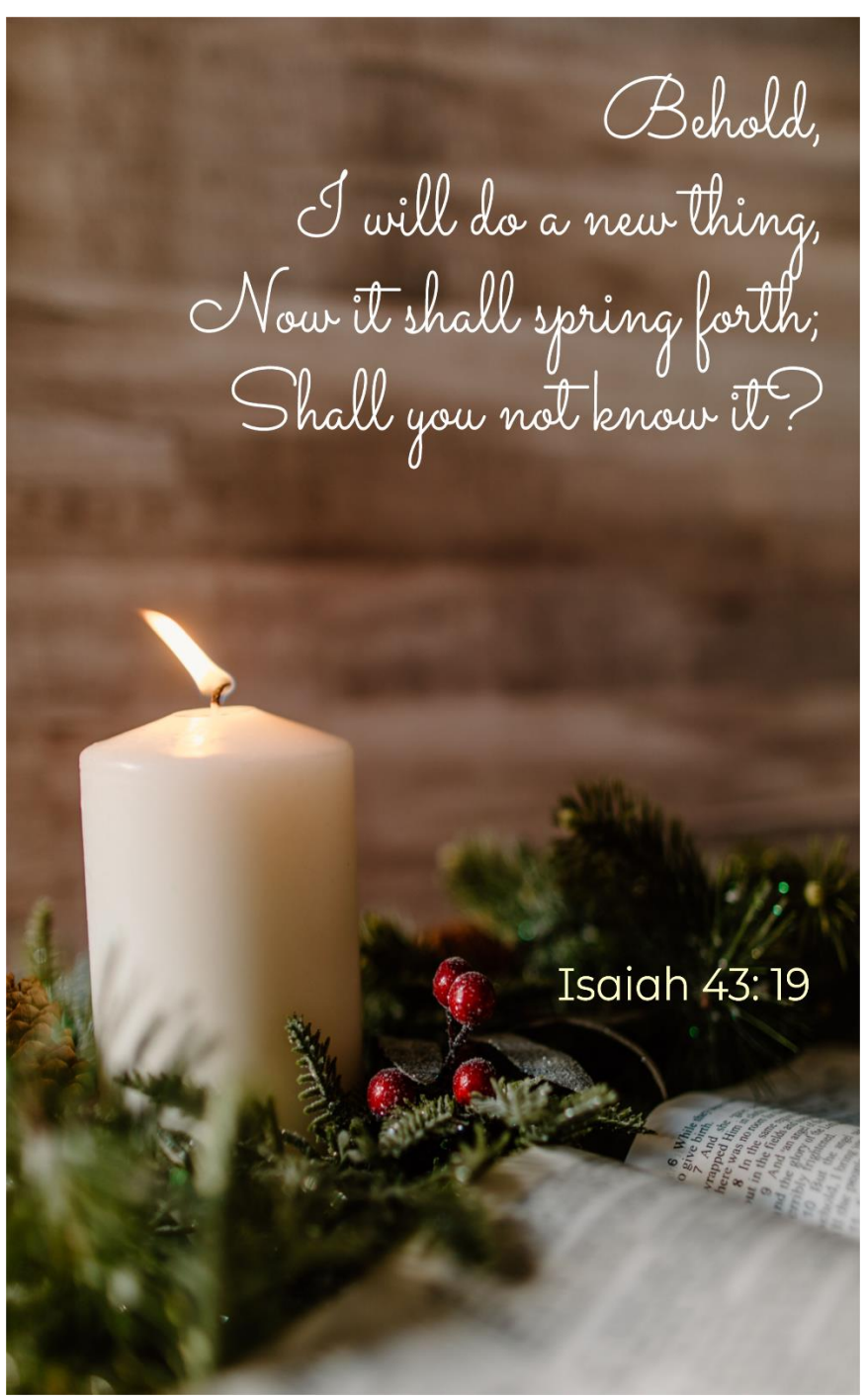
December 28-29, 2024